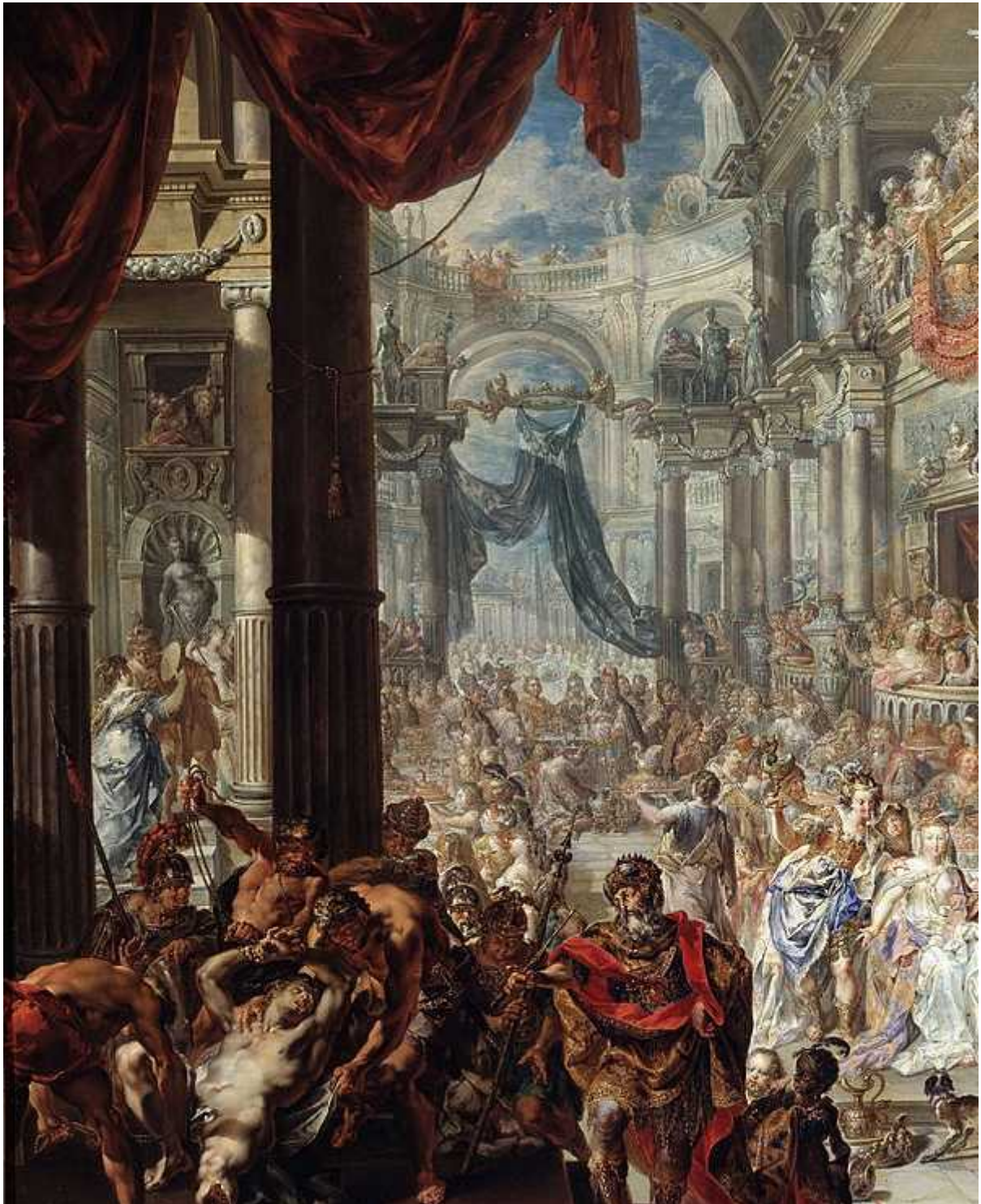
Johann Georg Platzer (1704–1761), The Parable of the Wedding Feast (cropped)